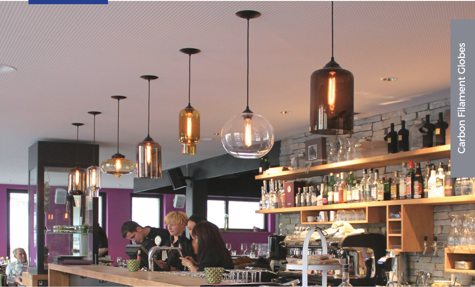
Carbon Filament Globes