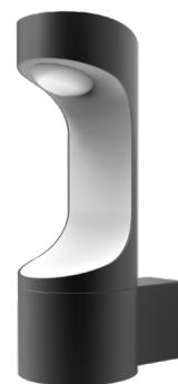
SETH1 (Wall Light)