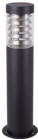
CLA1615SBL (Bollard Light)