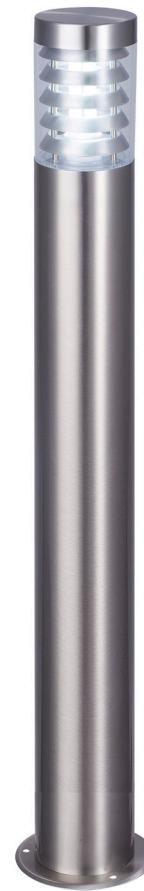
CLA1615L (Bollard Light)