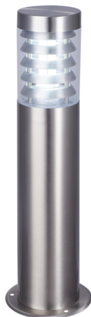
CLA1615S (Bollard Light)