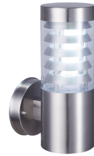
CLAW32 (Wall Light)