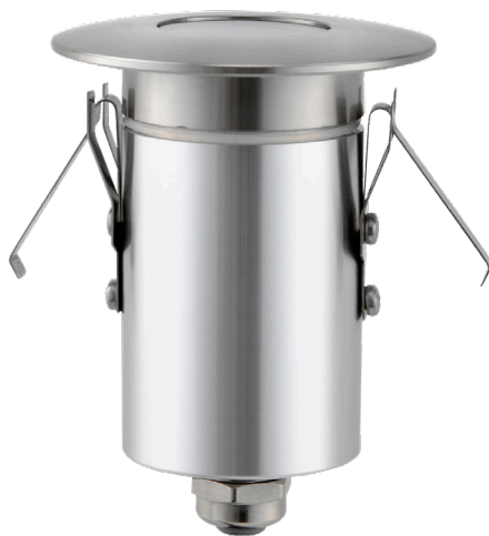
DECK01 & DECK02