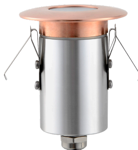
DECK03 & DECK04