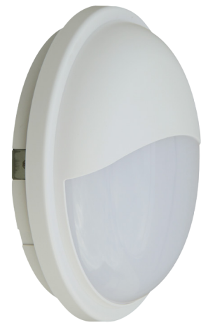
BULK16 & 18