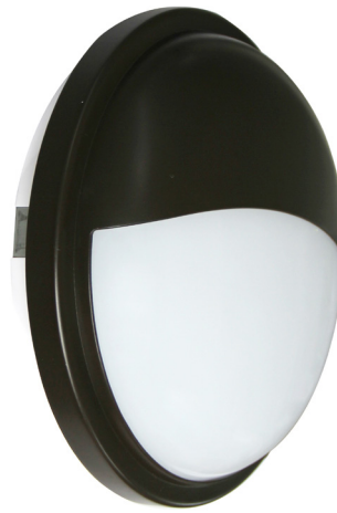
BULK15 & 17